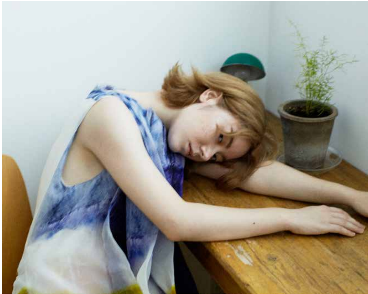
I FEEL YELLOW 私は黄色を感じる